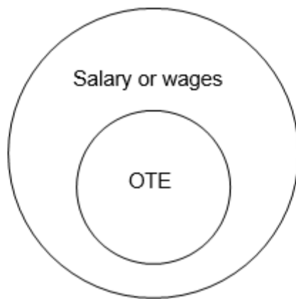
Diagram 1: Relationship between OTE and salary or wages

9. The following diagram illustrates the relationship between OTE and salary or wages.